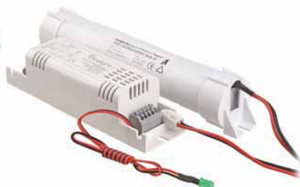
PRIMUS LED/3 h