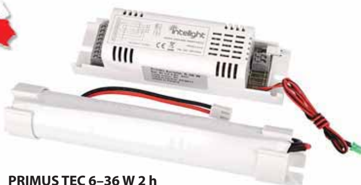
PRIMUS TEC 6–36 W 2 h